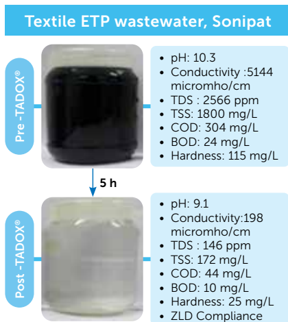
Figure 1: TADOX® treatment in industrial wastewater

wastewater treatment plants (WWTPs), depending upon the effluent matrix and requirement of treatment or even at the end of treatment trail to polish any stream like the MEE condensates, etc. It could be noted that along with improving the water quality, the technology has very less treatment time, small footprint and together with resource and energy efficiency, TADOX® integration is expected to bring down ZLD CAPEX by 20–25 per cent and OPEX by 30–40 per cent than current values.